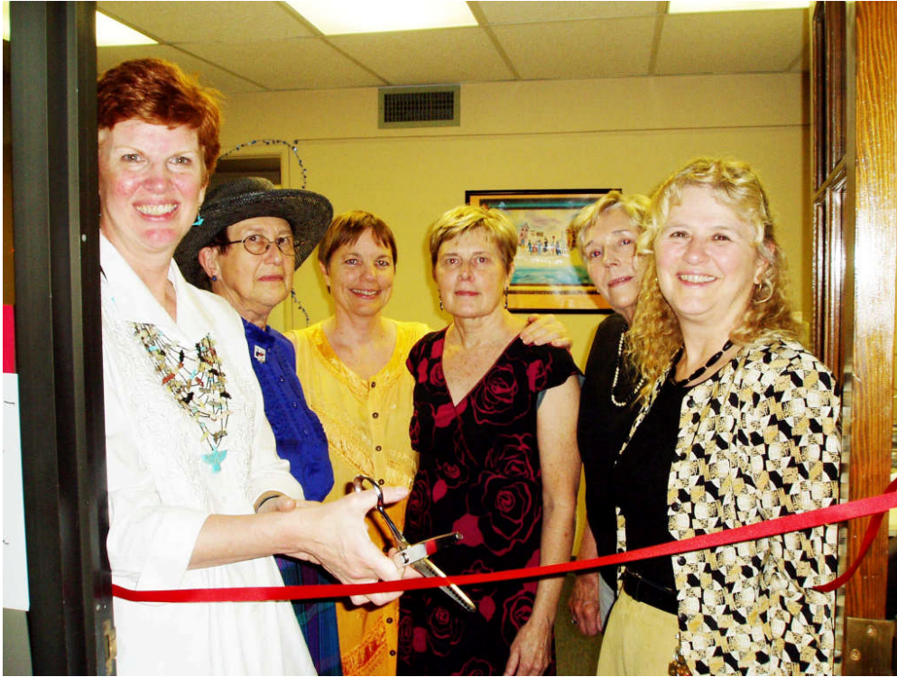
Cutting the ribbon at the new office (Left to right)